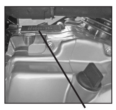
Engine serial number

Write down the serial numbers here for your future reference